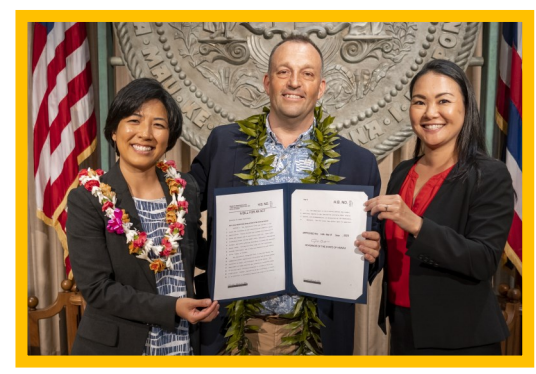
Bill Signing with Gov. Green