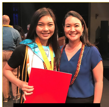
At Castle High School's Awards Night