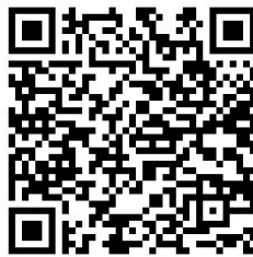
DOH "Take 10"

To see the DOH's Take 10 Guide and HI-EMA's YouTube video, please see the above links or scan the corresponding QR code: